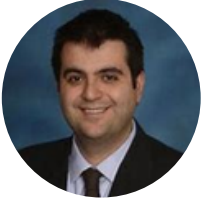
Bakri Alzarka Chair