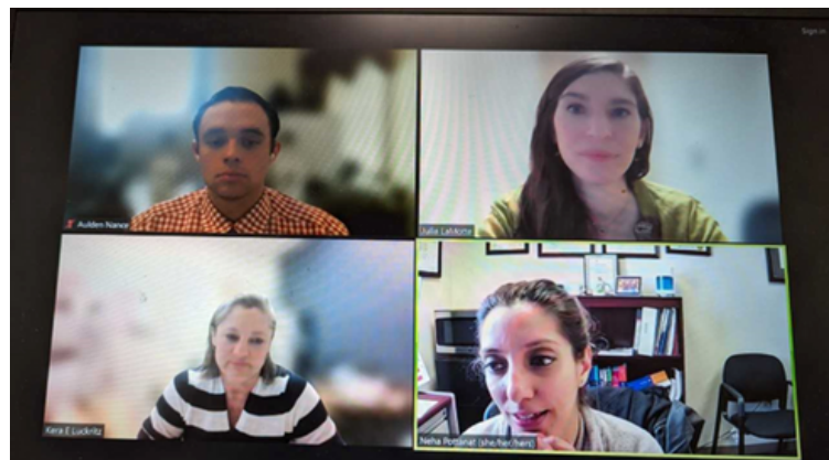
Figure 1. JELF scholars & mentors participating on Virtual Hill Day! Advocating for: NIH funding, Pediatric Subspecialty Loan Forgiveness, and supporting the OPTN Initiative (February 2024)

Through the JELF program, I hope to gain the advocacy skills needed to ensure that all pediatric patients with kidney disease receive the mental healthcare services to promote improved quality of life. Channeling my mom, I am eager to hone the craft of convincing those in positions of power to work towards justice together.