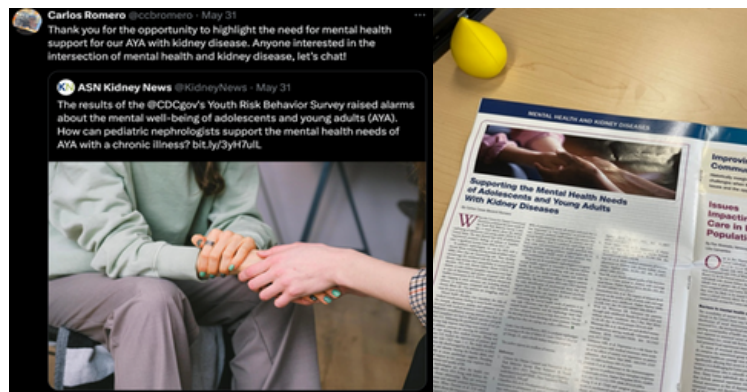
Figure 4. Editorial published on ASN Kidney News highlighting mental health needs of adolescents and young adults with kidney diseases.

As pediatric nephrologists, it is important to ask patients how they are coping and work with our multidisciplinary team (i.e., social workers, nurses, child life, psychologists, etc.) so we can maximize efforts to support patients and families. I plan to use the skills I learned through the JELF program to instigate others to increase mental health support for our patients.