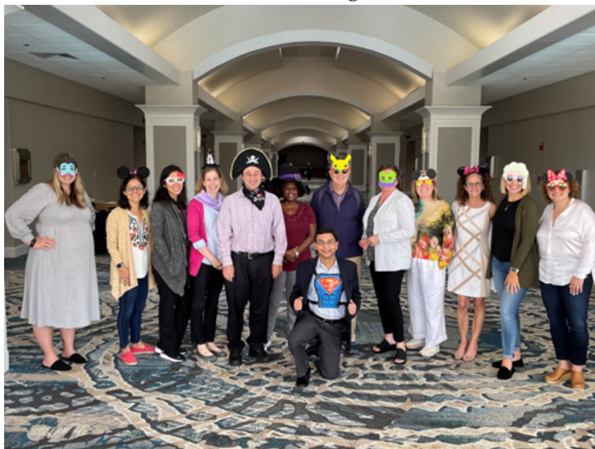
ASPEN Council Meeting – Orlando